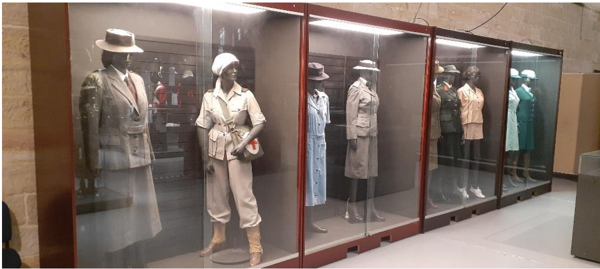
A special display of Women's Royal Australian Army Corps and Royal Australian Army Nursing Corps Uniforms.