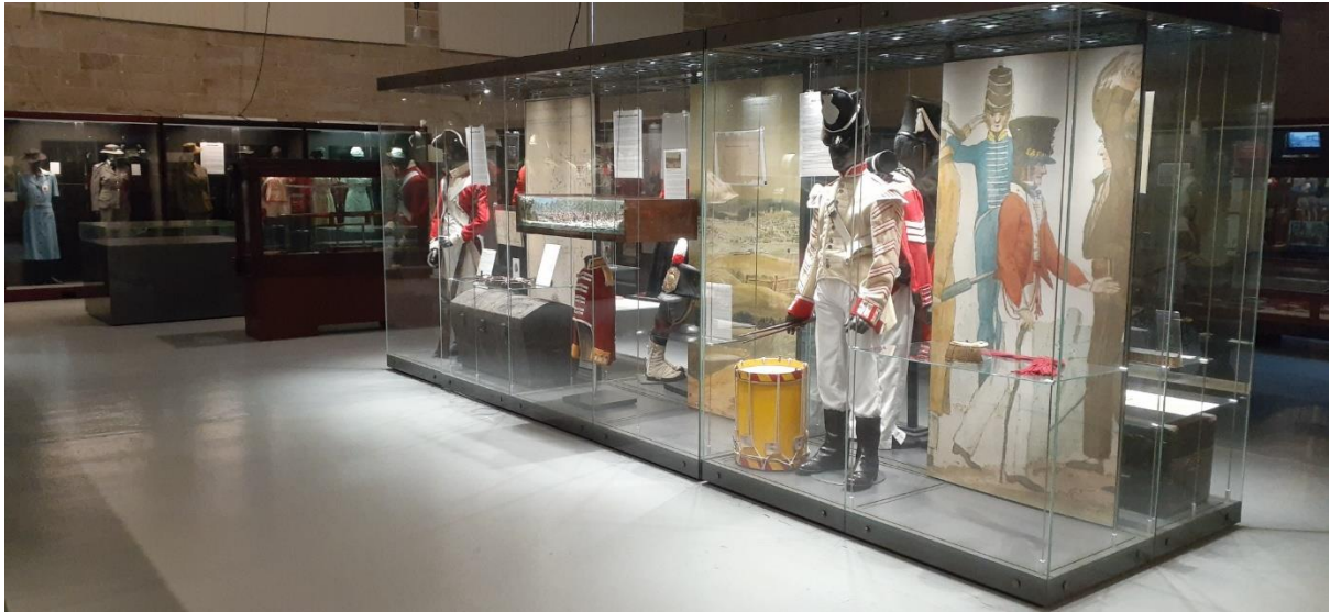
Another view of the Main Gallery depicting our Colonial Heritage.