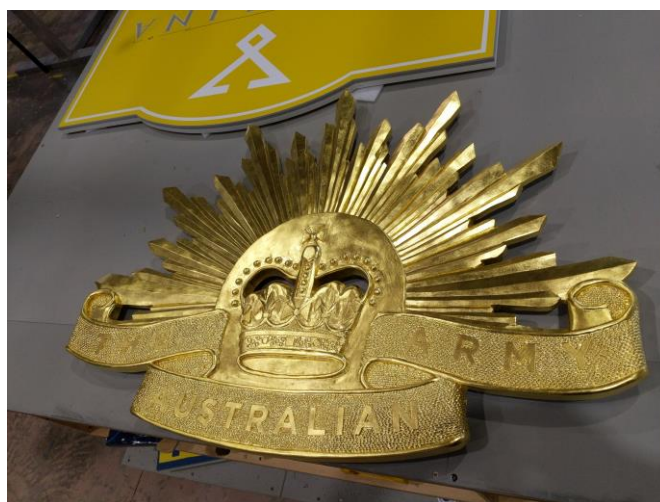
Here is a close up of the actual badge on our sign.