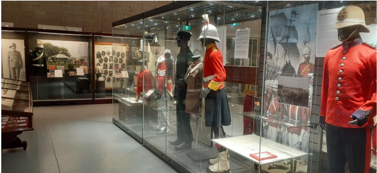
Still in the Main Gallery, our Pre 1900 display in this cabinet and the one below.