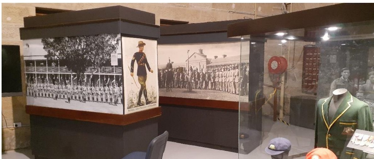
Some more Photographic Cabinets and within the glass cabinet to the lower right we have a cricket display as many famous cricketers from NSW fought in both World Wars. Artifacts are on loan from the Sydney Cricket Ground Trust Museum.