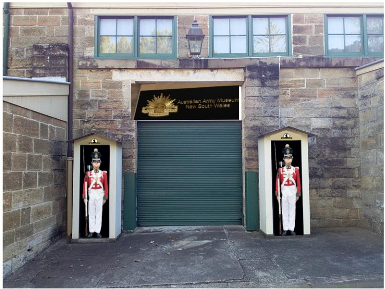
Your New Front Entrance.