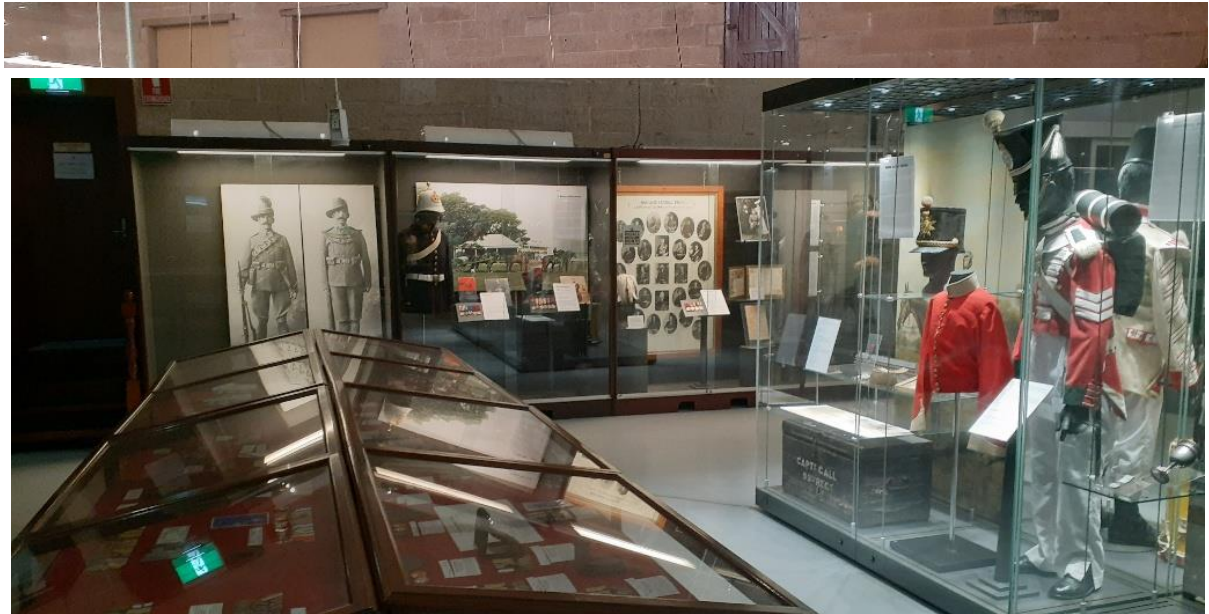
On the far wall you can see our Boer War Display.