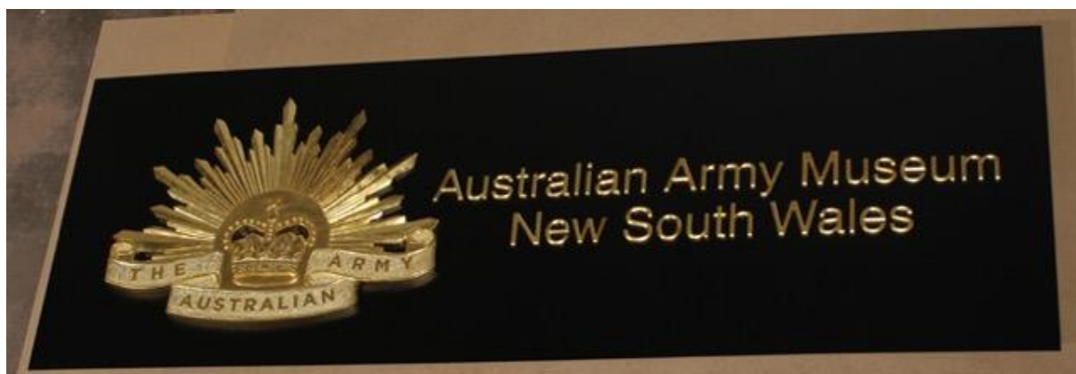
This is our new sign to be installed over the Museum Entrance.