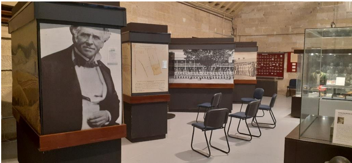
Photographic Display Cabinets located around the small theatre where we show the Documentary of the History of Victoria Barracks which was edited "From Sydney Cove to Paddington Hill" from the Mitchell Library. Highlight the Link below and click on it to view the film.