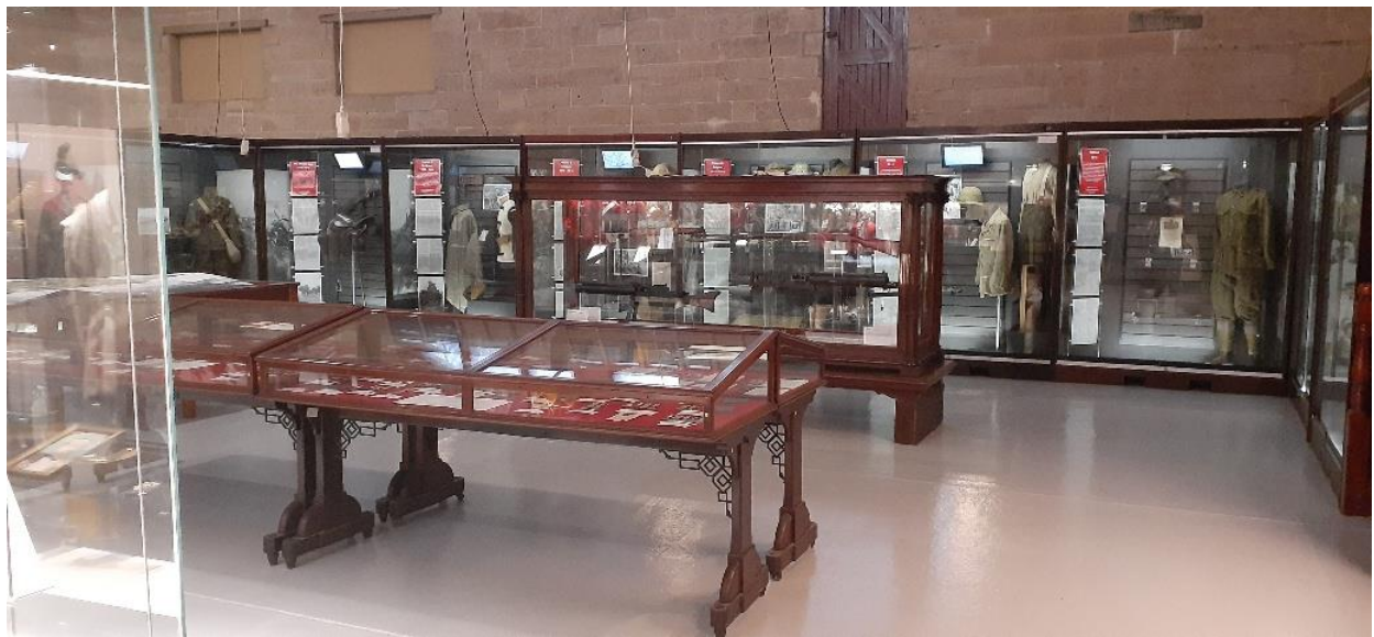
This is the First World War Section of our Main Gallery. Also, in this Section we have a cabinet with some of our specific and special Medal Collection and a cabinet with some weapons including a weapon that has been cross sectioned to show the workings of the weapon.