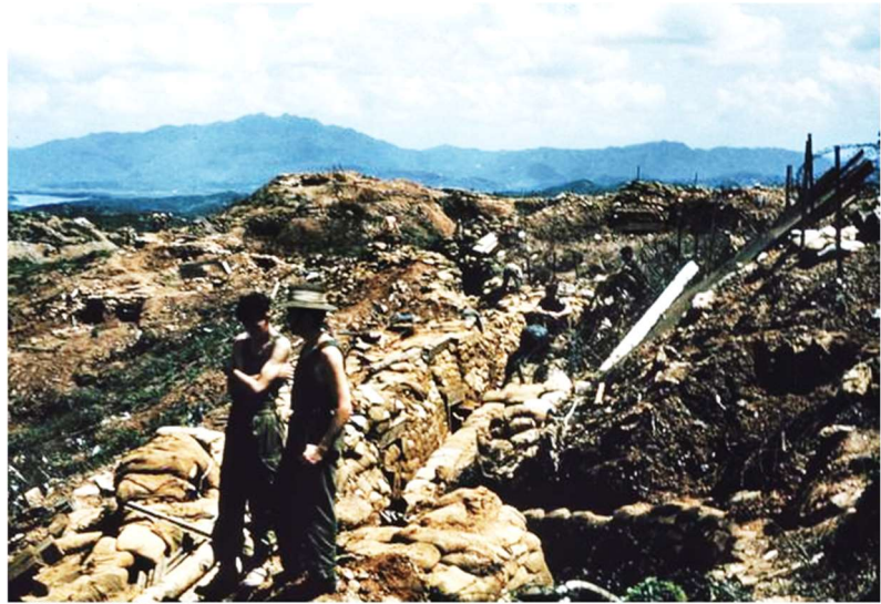
Two unidentified members of 2RAR stand above their front-line positions near the Hook the day after the armistice.

At 3am on 26 July the attacks ceased and on the following day, 27 July the Armistice was signed and then both sides withdrew two kilometres to create the Demilitarised Zone. Two days before the Armistice, Australia lost 5 men killed and 24 wounded. The Marines lost 43 men and 316 wounded.