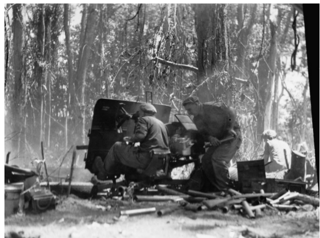
Fighting at Slater's Knoll Apr 1945

The central thrust towards the Pearl Ridge achieved its aim. The push toward Buka met with fierce Japanese resistance and stalled. An attempt to outflank the Japanese defences in the area of Porton Plantation failed with heavy casualties. The advance towards Buin progressed steadily against determined Japanese resistance. By late May, the Australians had closed up on the Mivo River but heavy rain and flooding in the area threatened the Australian lines of communication. Operations resumed in late July but combat operations were suspended in early August after the dropping of the atomic bombs.